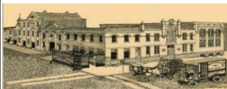
Yards has resurrected the Weisbrod and Hess Oriental Brewing Company facility in Kensington.

Please visit the Yards Brewery website www.yardsbrewing.com for directions. The Yards Brewery is easily accessible by public transportation (Septa Route 5 bus and Frankford EL). Johnny Brenda’s is located in close proximity to Yards. We can arrange carpooling for members reaching Yards by public transportation.